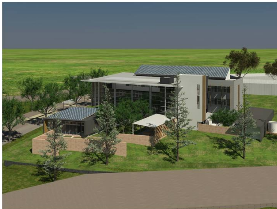
Figure 1: Aerial View of the ISDA Building

Construction of the building began in early 2007 and was completed in July 2008. Figure 1 is a picture of the building.